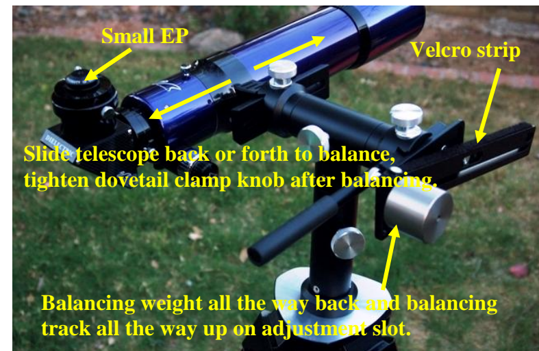
Figure 4: QBS setup step 1