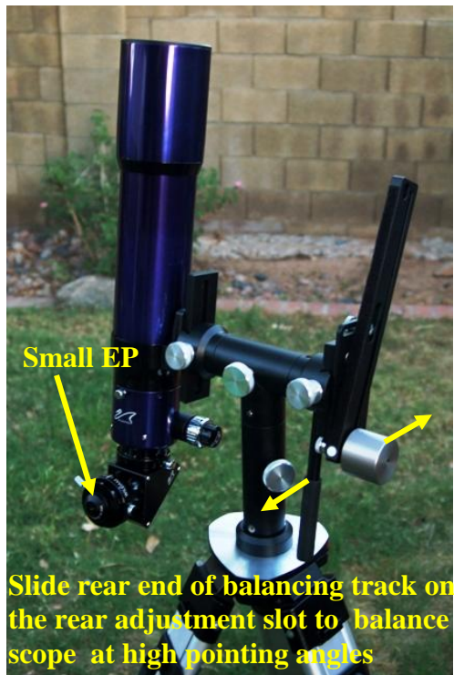
Figure 5: QBS setup step 2.

When the telescope is properly balanced, it takes the same amount of force to swing it up or down and it will