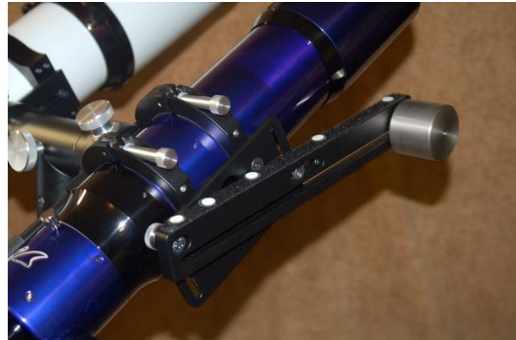
Figure 8: Setup for double telescope operation

It is preferable to attach the QBS to the lighter of the two telescopes being used, for better Azimuth axis balance. Follow the steps listed in the “setting up QBS” section to setup QBS for double telescope use.