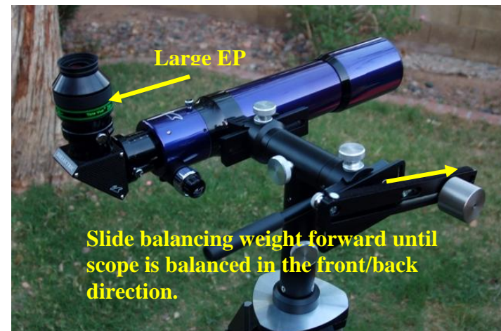
Figure 6: QBS setup step 3