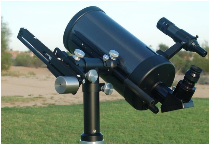
Figure 3: QBS in left side clamp configuration

The QBS is shipped configured for mounting to the right side dovetail clamp. If left side installation is desired, reverse the balancing track so the QBS is configured as shown in Figure 3.