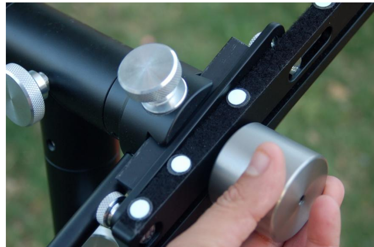
Figure 2: Attaching the QBS

The QBS attaches to the left or right side dovetail clamp by sliding the short dovetail adapter into the corresponding dovetail clamp, as shown in Figure 2. To facilitate installation, place the balancing weight so that it is aligned with the altitude axis. Tighten dovetail knob to secure QBS in place.